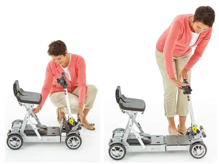
Pull the front wheels forwards until the floorpan is flat.

Lock the backrest in place by clipping it into the seat base.