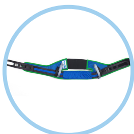
Deluxe Feeder Sling