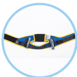
Patient Turner Belt

For additional user support, compatible slings/belts are available