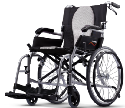
Ergo Lite 2 with self propel, quick release rear wheels.

Swing in and out detachable footrests add convenience when the user transfers in tight spaces.