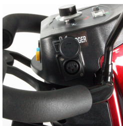
Photo 14 Charging port

The Excel Galaxy II is equipped with two closed, maintenance free batteries. Van Os Medical recommends to charge the batteries fully before first use. We advise you to charge them for at least 12 continuous hours. The charger port is located on the tiller (see photo 14). The batteries of the Excel Galaxy II can not be removed for the purpose of charging.