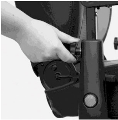
Photo 5 Armrest height adjustment

Not only can the armrests of the Excel Galaxy II be flipped up, they can also be adjusted in height. To adjust the height of the armrests, unscrew the star knob on the back of each armrest (see photo 5) until the arms have loosened. Then pull or push each arm up or down to adjust the armrest height. When the desired armrest height has been achieved, re-screw the star knobs until the armrests are fixed in position.