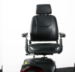
Photo 11 Rotated seat position