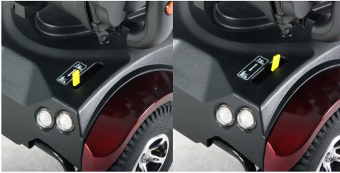
Photo 12 Drive position

The Excel Galaxy II has two settings, namely the drive setting and freewheel setting (see photos 12 and 13). The scooter should always be in drive when you want to use it. The freewheel setting allows you to move the scooter without turning it on. When the scooter is put in freewheel mode, it can be pushed without the motor giving resistance.