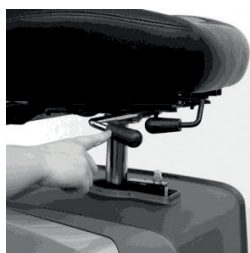
Photo 8 Seat adjustment levers

It is possible to adjust the height of your Captain seat chair however you should never do this yourself and always contact your local Excel dealer, to do carry out this adjustment for you.