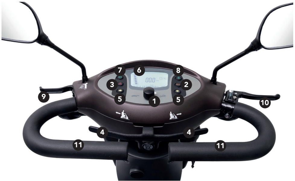
Photo 1 Dashboard display

The Excel Galaxy II is equipped with a clear dashboard. The dashboard consists of different components that all have a different function. Below, several components are explained further: