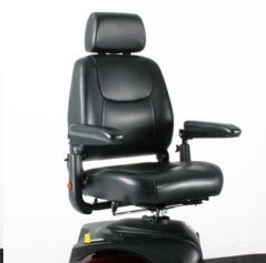
Photo 10 Angled seat position