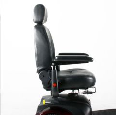
Photo 9 Side seat position