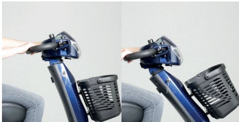
Photo 2 Upright tiller position