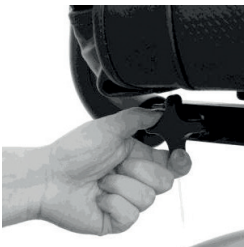
Photo 6 Width adjustment Star knob

The armrests can also be removed completely. To remove the armrests, after loosening the star knob, slide out the armrests all the way.