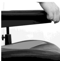
Photo 4 Down armrest

The Excel Galaxy II is equipped with height and width adjustable flip-back removable armrests. To flip the armrests up, simply pull the armrests upwards. This makes getting on and off your scooter easier to do.