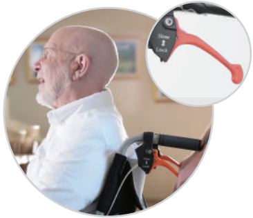
Push & Pull Brake System

Designed with both users and caregivers in mind, all movable parts are highlighted in high-visibility orange for easy identification and operation.