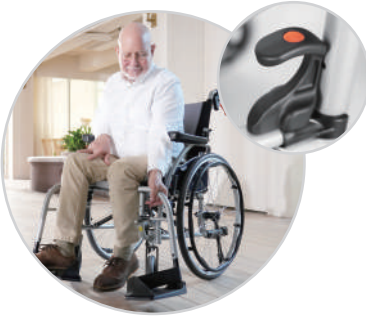
Detachable Swing-Away Footrests