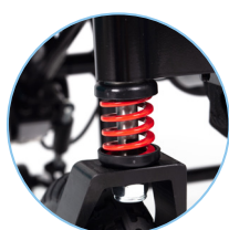
Front wheel suspension