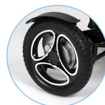
Stylish black/ silver hubs