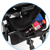
Handy underseat storage