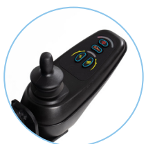
User friendly Intelligent controller

*Speed and range may vary depending upon user weight, type and incline of terrain, weather, battery charge and condition, operating speed and general driving situation.