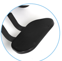
Flip up footrest (nonslip PU coating)