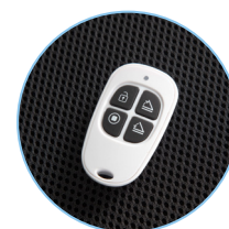
Remote Fold Operation