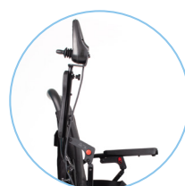
Flip up armrests