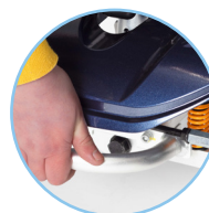
Front impact bar / carry handle