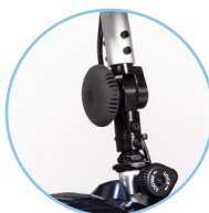
Angle adjustable tiller