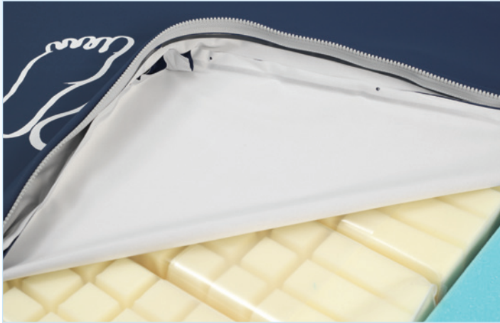
White inner substrate - fluid ingress becomes easily identifiable to aid infection control guidelines

There is no requirement to move the patient off the bed to step them up to an alternating system or step them down to a static mattress.