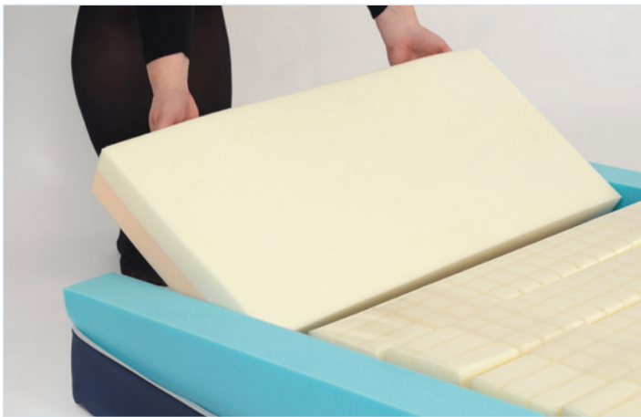
Turning pillow - provides additional comfort