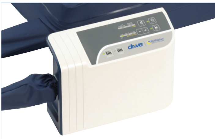
Power unit - easy to use, no requirement to move the patient out of bed when stepping them up to the alternating mode