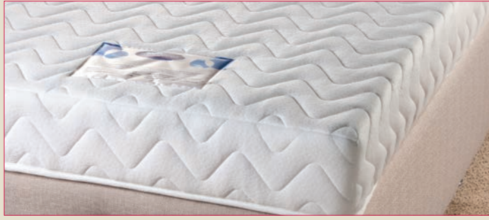
Latex Mattress Code: RMATLTX30

Latex foam mattresses are a recent innovation to the market and are starting to become more popular because of their quality and great levels of comfort. Excellent heat reduction and breathable properties, which are more efficient than any other type of foam, allowing the mattress to breathe and keep fresh. Hypo allergenic and anti microbial, the material which prevents dust, mould and bacteria from settling in the mattress.