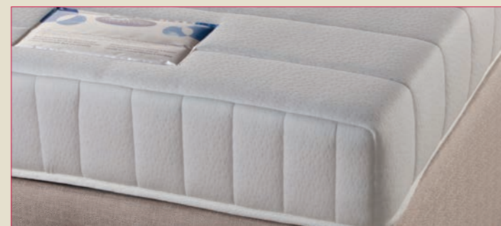
Reflex Foam Mattress Code: RMATRF

Memory foam has a unique open cell structure that reacts and responds to body heat and weight by moulding to the contours of your body, therefore optimising the support it provides. It is the most effective material for relieving pressure points and used for prevention of pressure sores and has multiple orthopaedic benefits making a huge difference to your quality of sleep. This mattress is made up of 5cm memory foam bonded onto 15cm of reflex foam.