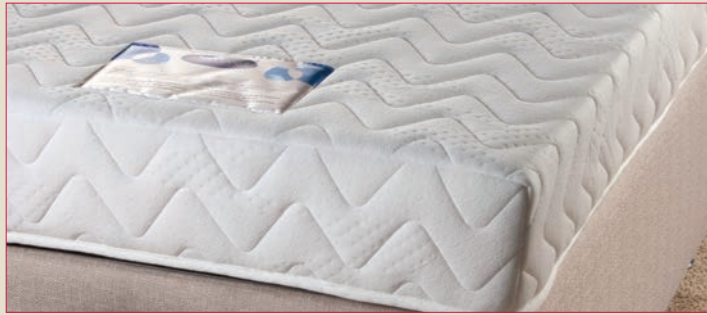
Memory Foam Mattress Code: RMATMF

Pocket sprung mattresses are one of the most comfortable mattresses with an effective design that provides high levels of comfort and support where it's needed most. They are designed to contour with your body and are constructed of numerous individual springs that move independently, giving an exceptional amount of support and cushioning. A pocket sprung mattress uses these individual springs to respond to everyone's individual body weight, increasing their usability and comfort.