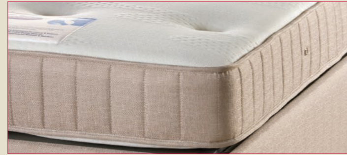
Pocket Memory Foam Mattress Code: RMATPM

Memory foam has a unique open cell structure that reacts and responds to body heat and weight by moulding to the contours of your body, therefore optimising the support it provides. It is the most effective material for relieving pressure points and used for prevention of pressure sores and has multiple orthopaedic benefits making a huge difference to your quality of sleep. This mattress is made up of 7cm of memory foam bonded onto 15cm of reflex foam.