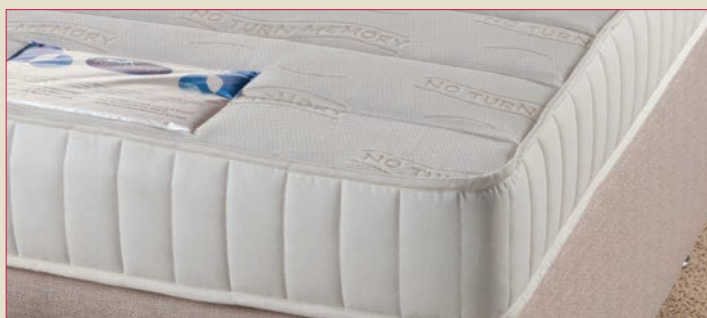
No Turn Memory Foam Mattress Code: RMATMF30-2

The pocket sprung part of the mattress is made with superior quality springs providing the familiar bounce of a traditional mattress. A 7cm layer of high density memory foam is added to provide excellent comfort and support, moulding to your body for a comfortable night's sleep. Owing to the Thermal properties associated with memory foam this provides a warmer option during the winter months. Alternatively you can turn the mattress and sleep comfortably on the cooler side of the 500 pocket spring system, thus providing a firmer support where needed. Available in beige or grey.