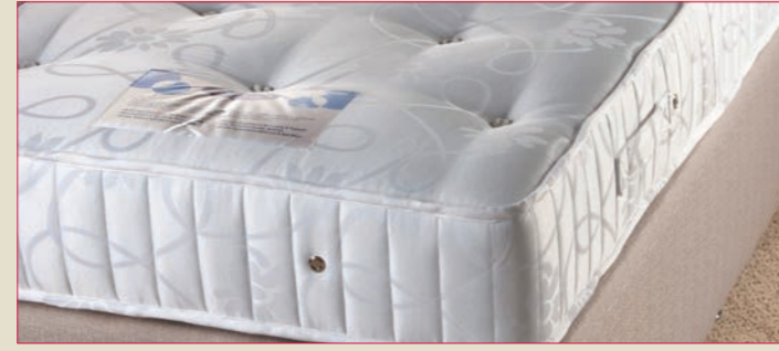
Pocket Sprung Mattress Code: RMATPS

Latex foam mattresses are a recent innovation to the market and are starting to become more popular because of their quality and great levels of comfort. Excellent heat reduction and breathable properties, which are more efficient than any other type of foam, allowing the mattress to breathe and keep fresh. Hypo allergenic and anti microbial, the material which prevents dust, mould and bacteria from settling in the mattress.