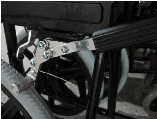
Parking Brake On

These levers are to be used by hand only.