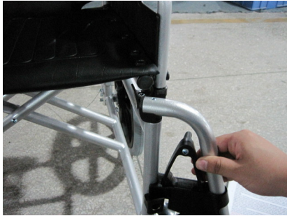
Leg rest 1