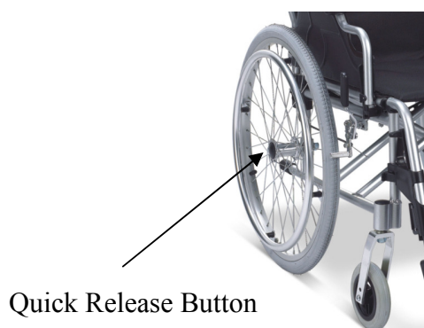
Quick Release Button

To remove the rear wheels depress the quick release button and pull the wheel away from the frame of the wheelchair. For safety reasons this should only be carried out when the wheelchair is unoccupied