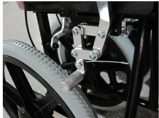
Parking Brake Off