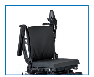
Flip back armrests