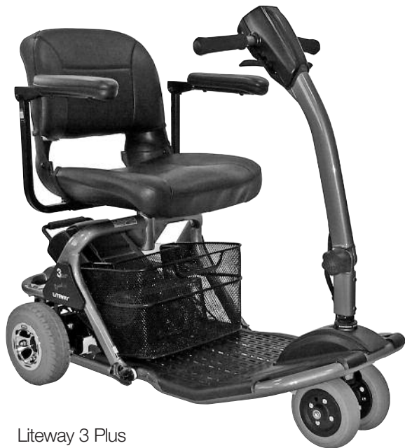
Liteway 3 Plus