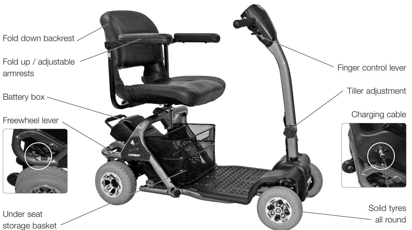
Photo shows Liteway 4 Plus model scooter. The Liteway 3 Plus is a 3 wheel version. See the specification for differences.