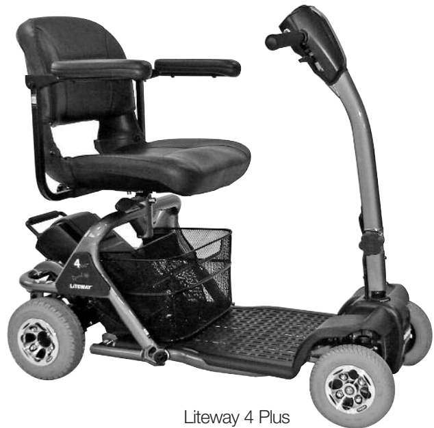
Liteway 4 Plus

Electric Mobility Euro Ltd offers these lightweight, manoeuvrable scooters for convenient indoor and outdoor use. They can be easily and quickly dismantled for transporting in the boot of a car. So long as your scooter is maintained and operated in accordance with this manual it should last for many years, and provide you with freedom and independence.