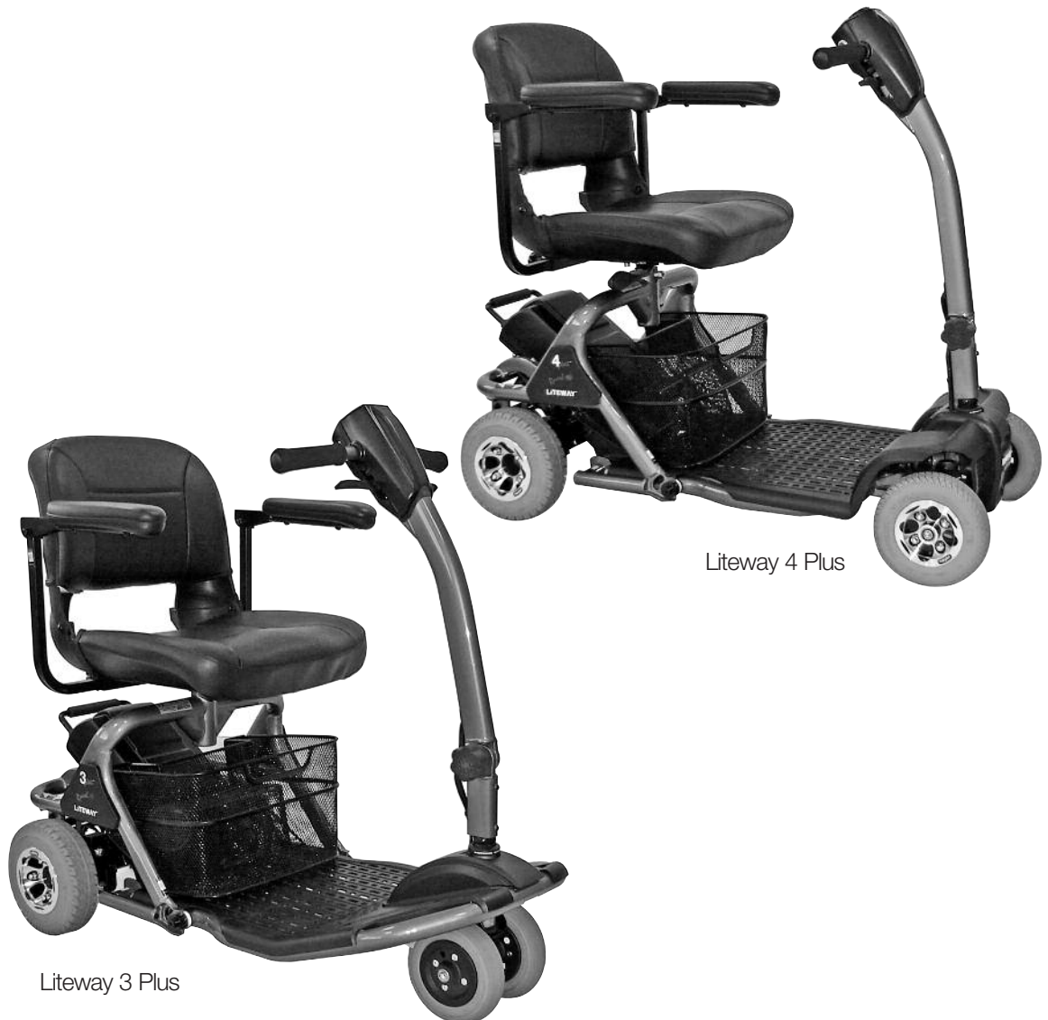
Liteway 3 Plus