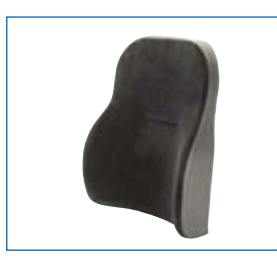
Deep contour backrest