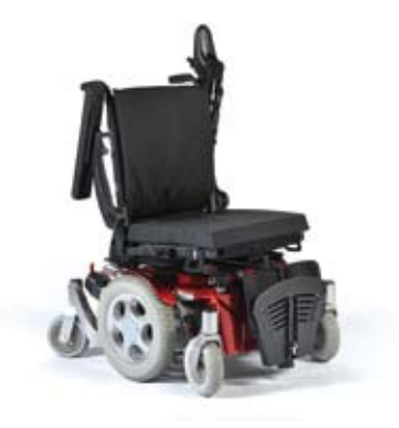
Flip-up armrests and foot rests for easy accessibility