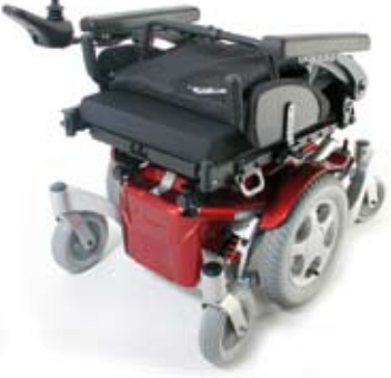
Lift-off backrest for easy transportation and storage