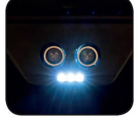
Automatic backup sensor