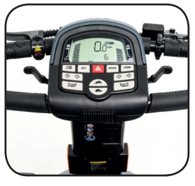
LCD Delta tiller display