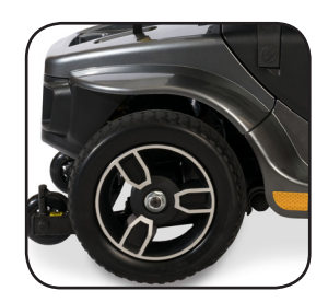
Solid Alloy Style Wheels