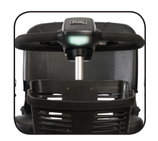
Front and Rear Lights