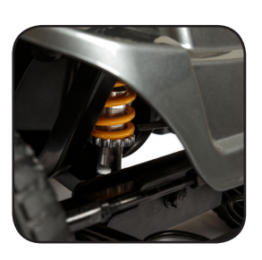
Comfort-Trac front and rear suspension