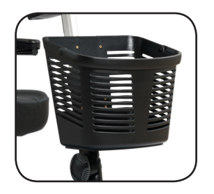
Large Tiller Basket