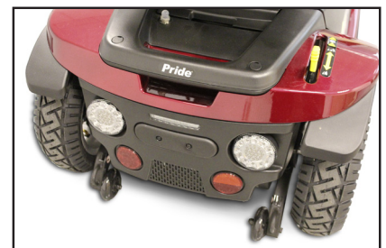
NEW rear LED lights