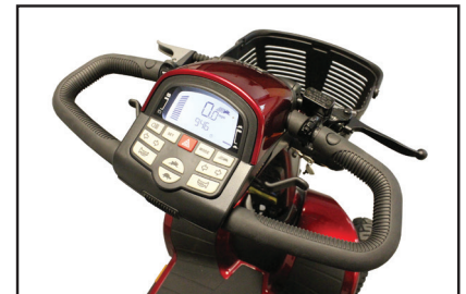
NEW LCD console with speed sensor (standard)