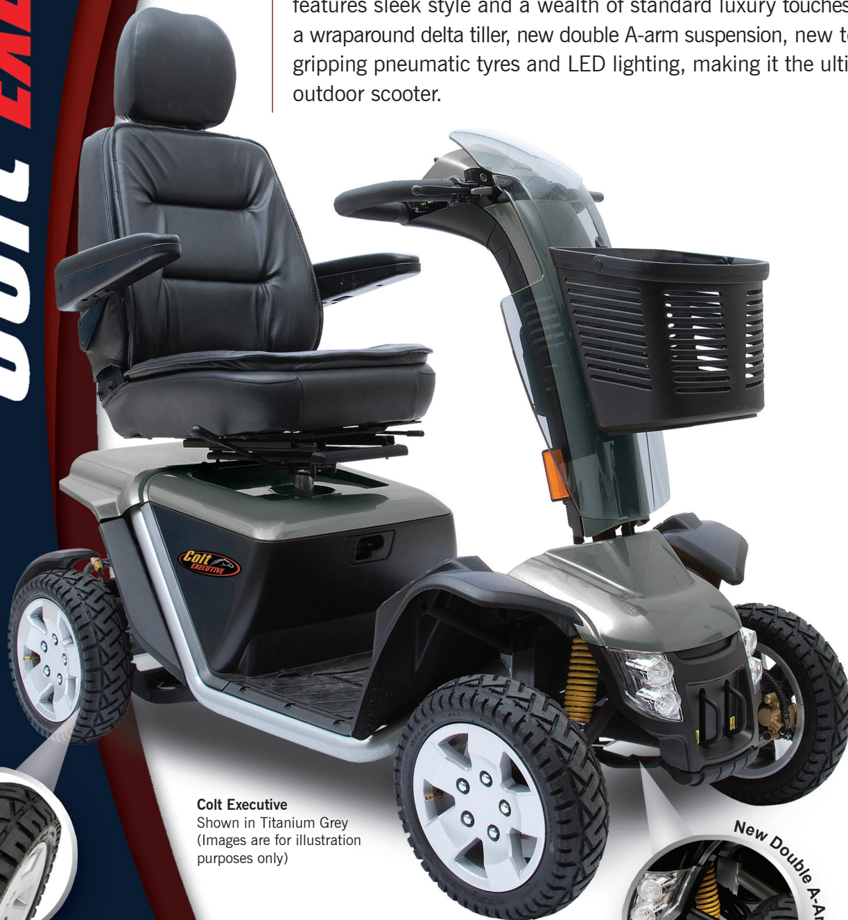
Colt Executive Shown in Titanium Grey (Images are for illustration purposes only)

Bristling with high-performance features like full suspension, low-profile tyres and a hydraulic sealed brake system, the Colt Executive is a blend of power and precision. The Colt Executive features sleek style and a wealth of standard luxury touches like a wraparound delta tiller, new double A-arm suspension, new terrain gripping pneumatic tyres and LED lighting, making it the ultimate outdoor scooter.