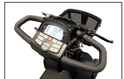
NEW LCD console with speed sensor (standard)