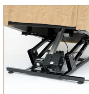
2 Independent motors.