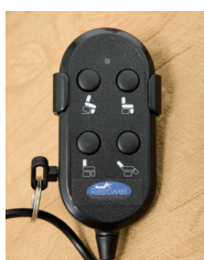
Four button hand controller.