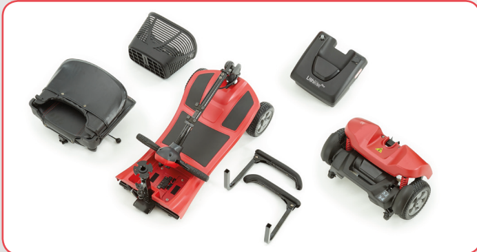
Come To Bits Easily

The Lithilite range adds innovative Lithium battery technology to a high quality, tried and tested design.