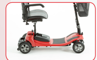
High Ground Clearance