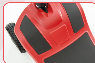
Long Flat Pan For Leg Room