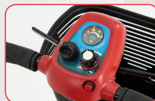
Soft Grip & Dual Controls