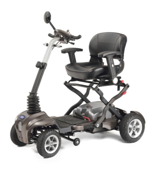
Maximo & Maximo Plus Operating Instructions and Owners Handbook