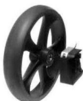
Speed Reduction Wheels