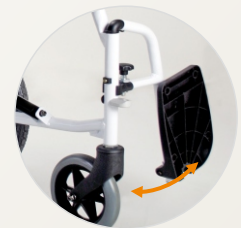
Swing in/out detachable footrest hangers

The lowest transportation weight is only 6.4 kg (without footrest hangers and rear wheels)