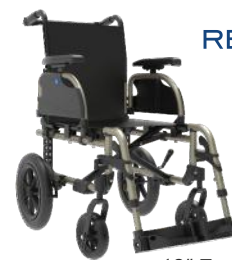
12" Transit Propulsion

The Icon 40 is part of the modular Icon Mobility System within the group of Icon wheelchairs with interchangeable parts. The Icon 40 meets the wishes and requirements of a varied group of users. The many adjustment options offer the possibility to adapt the chair to the wishes of the therapist or the individual wishes of the user. The design has a sideward locking mechanism for the legrest to provide a clear front to avoid hooking and damaging of clothes, limbs or furniture.