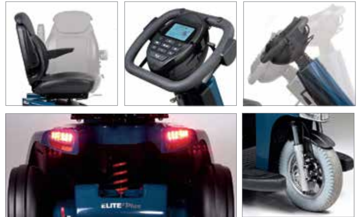
Front & rear hydraulic suspension