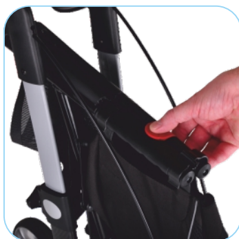
Stays firmly closed with the lock and is easy to open with the push button

The Explorer can be fitted with most of the broad range of Rehasense accessories.