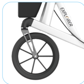
Soft wheels constructed with double PU layer