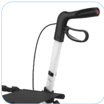
Push handles are height adjustable