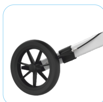
Maintenance free brakes and TPE-covered unbreakable wheels

Backup is CE-marked and fulfills the requirements of EU directive 93/42 EEC for medical devices.