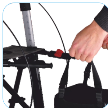
Practical easy-to-remove shopping bag. With special designed easy-to-go clips