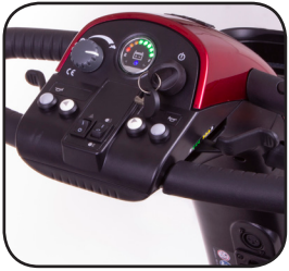
Easy use LED Delta Tiller Design