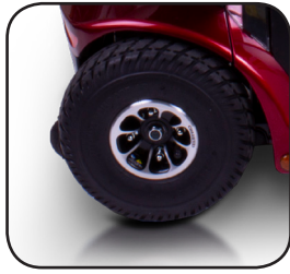
10" Front & Rear Pneumatic alloy style wheels