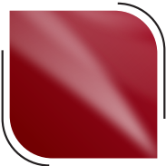
Candy Apple Red