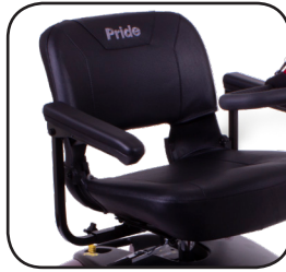
Half Back Fold-Flat Seat