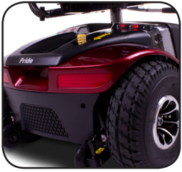
Rear LED Lights