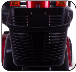
Large Tiller Basket