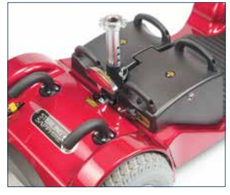
With its large batteries carrying you in style and comfort, the Sapphire 2 is the scooter you'll want to go further on!

Now the Sapphire 2 can be loaded into your vehicle. Luckily, as one of the lightest scooters in its class, this is no problem with the Sterling Lift dual handles fitted to the batteries and rear drive unit. These make lifting and handling the parts safer and more comfortable.