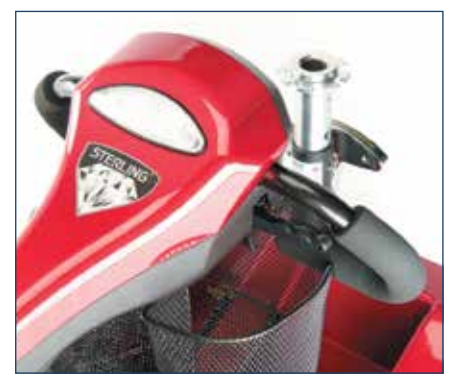
The Sterling Lock system is cable and connector free so there are no fiddly bits to deal with.