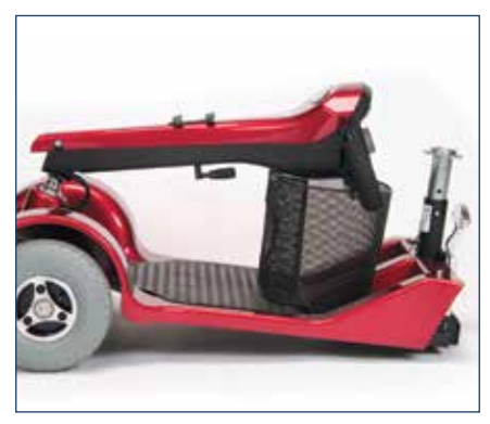
The tiller can be safely secured in position for transporting.