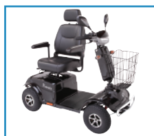
Waterproof Panel and Twin Mirrors